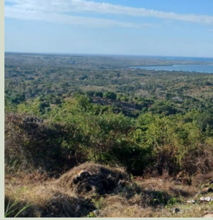
Foto: Blick vom Grundstück des Organica Farmcampus

As you have learned from the last Bakterien-Post I am in the process of setting up an EM training center in Tanzania for regenerative agriculture for Africa.